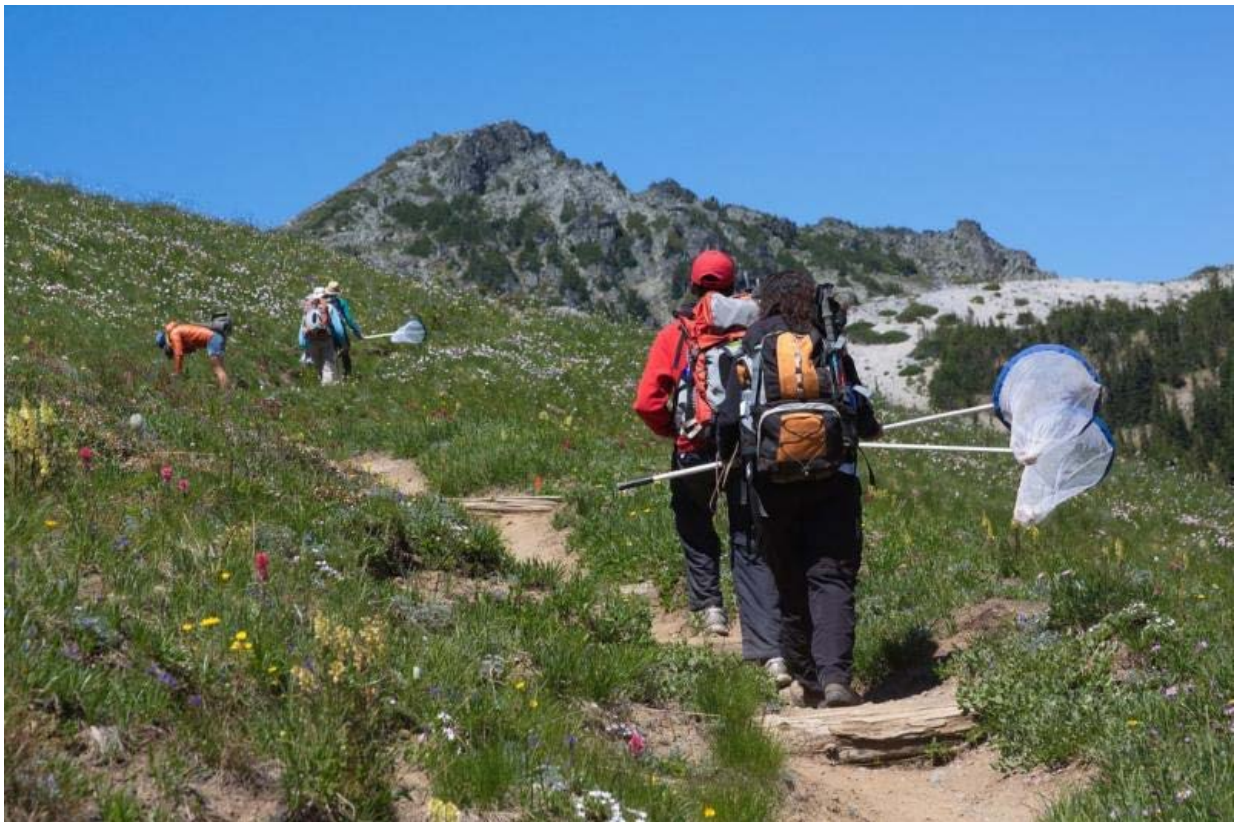
Volunteer Citizen Scientists tracking down butterflies in the North Cascades

Philanthropy champions are all around us! During GiveBIG on May 5th, these champions contributed more than $10,000 for Mount Rainier, North Cascades, and Olympic National Parks.