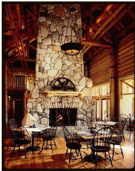
Freestone Inn, Mazama