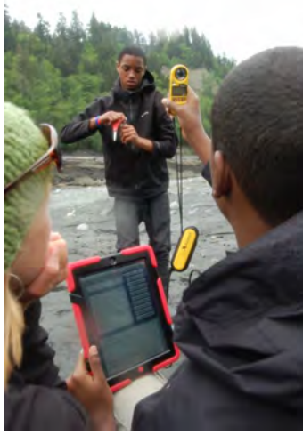
Rangers on Campus