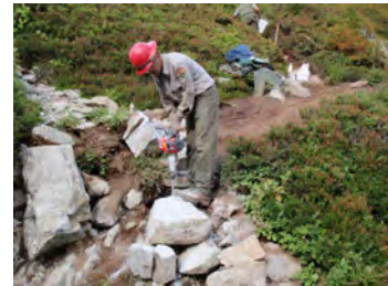
Sahale Arm Repair