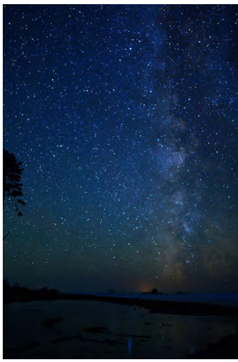
Dark Skies Interpretation