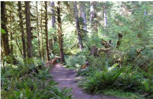
Spruce Nature Trail