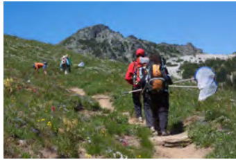
Cascades Butterfly Project